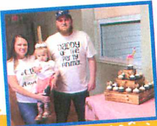
Birthday Party @ the Community Center

You can visit www.MyFWC.com/Gators for more information about alligators.