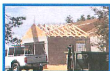
New Home Construction