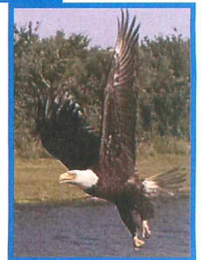
Eagle on Golf Course