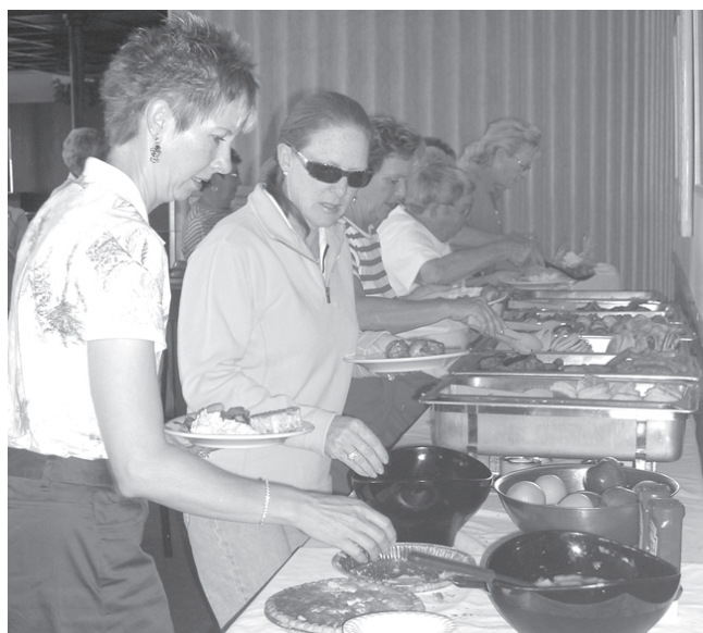
Members enjoy a buffet breakfast