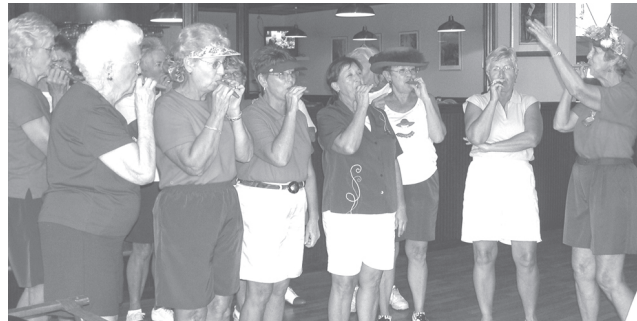
Red Hat Party Girls play kazoos