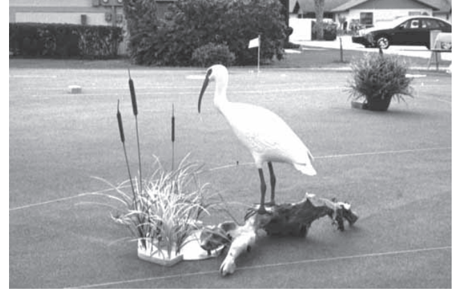
Let the putting contest begin!