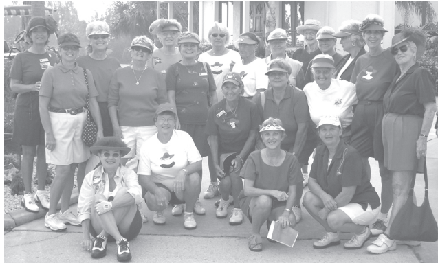
Red Hat golfers

The organizers devised a challenging game that included a putter and three clubs of your choice. The first golf cup was surrounded with red tees, and the second hole obstacle was to putt with a whiffle ball. Other holes had other fun events.