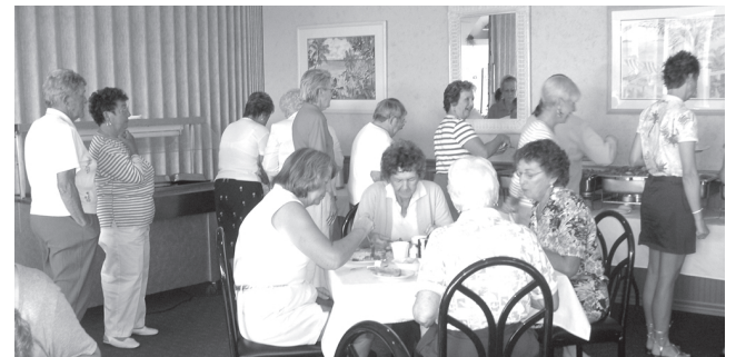
Members enjoy a buffet breakfast