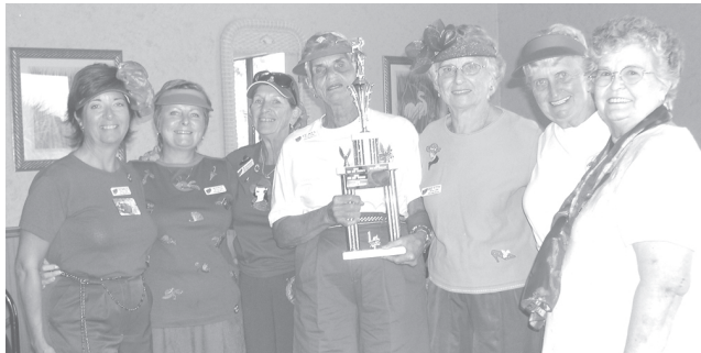
Red Hat Mamas accept the trophy