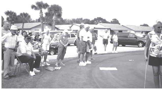
The crowd watches an exciting putting contest