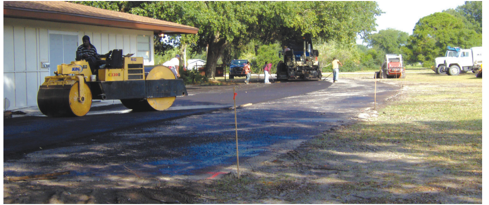
After years of dust when it is dry and mud when it is wet, the Community Center finally has a paved road and additional handicapped parking. This much needed improvement will greatly enhance the Center's usage.

While the Community Center paving was being done, KDL Contractors were asked to put down a 60' by 100' basketball pad. Baskets will be placed in the middle of each side, allowing four different three-on-three games to be played at once. It has been many years that both young people and adults have been asking for this project.