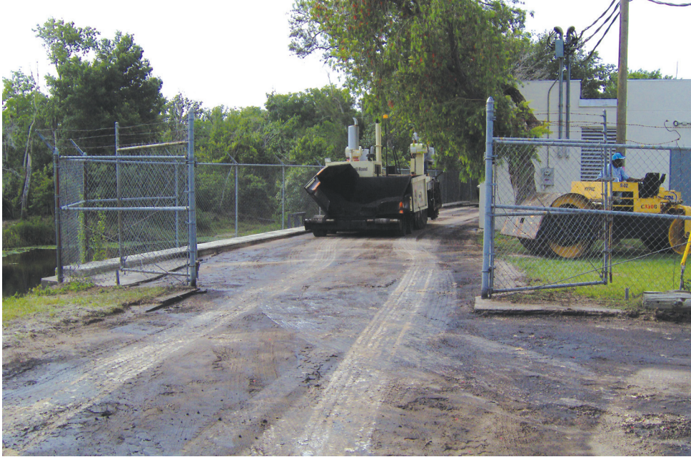
A sinkhole developed in the rear of the station that needed repair and renovation. At the same time that work was being done, it was decided to pave the roadway.

The Spring Lake Improvement District Board of Commissioners is committed to the various capital projects and improvements that are needed for our community; many of which have been delayed over the years. During the next several months you will continue to see projects at the various parks, the tennis courts and playground and picnic areas at Pine Breeze Park. In case you haven't seen some of the projects, here are some pictures for you to review: