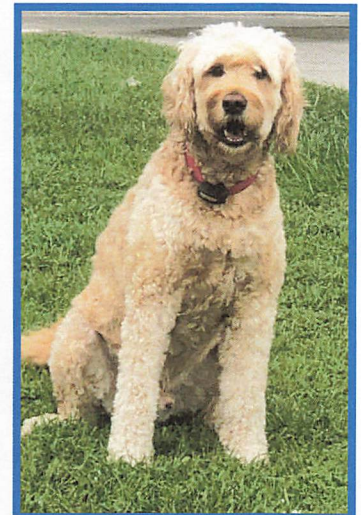
Dog population increasing thanks to the Bark Park