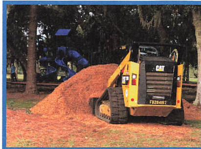
Installing new mulch at the Pine Breeze Playground