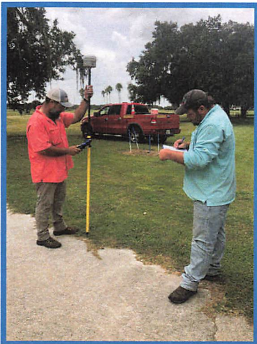
Surveyors spending a lot of time in Spring Lake