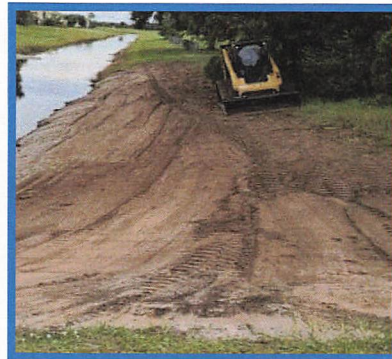
Canal bank restoration is ongoing