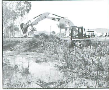
Clubhouse Lane Before