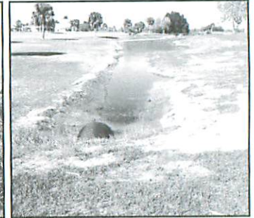
Clubhouse Lane After