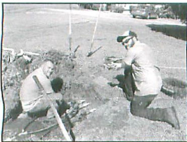
Rick Scott Governor